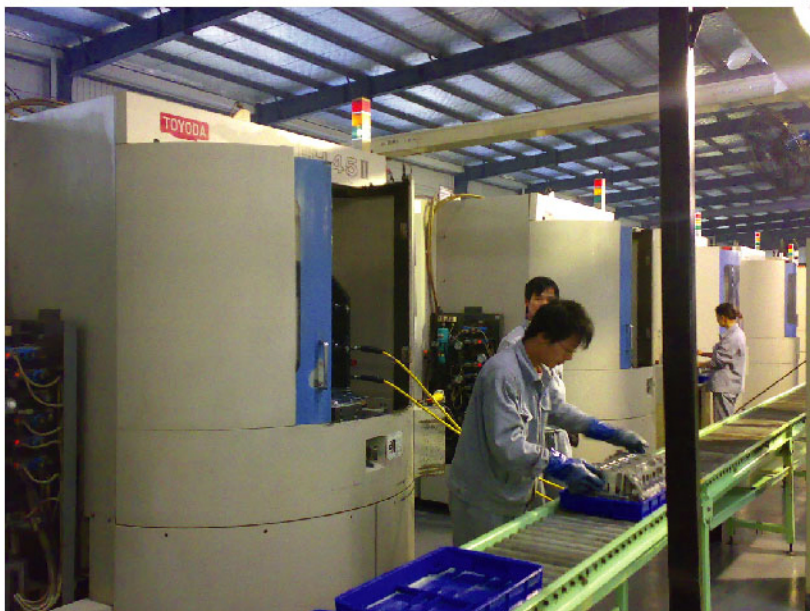
High Energy Efficiency Engine Cylinder Head and Block Production Line Introduced By the Company